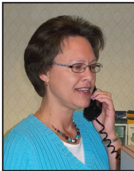
Carol Burnett show as her favorite TV series and reading The Adventures of Huckleberry Finn .