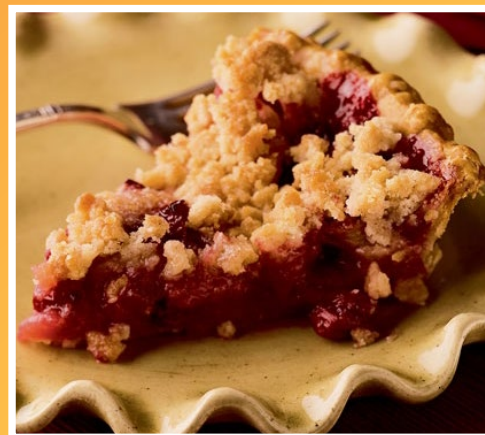
A touch of color and tartness sets this apple pie apart from the classic standby.